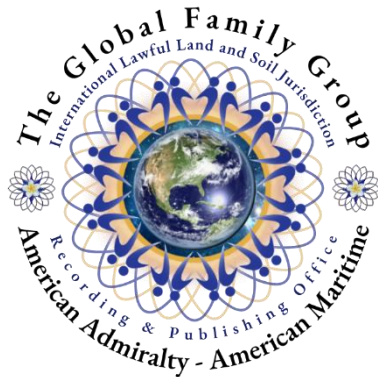
The United States of America, Treasury Director